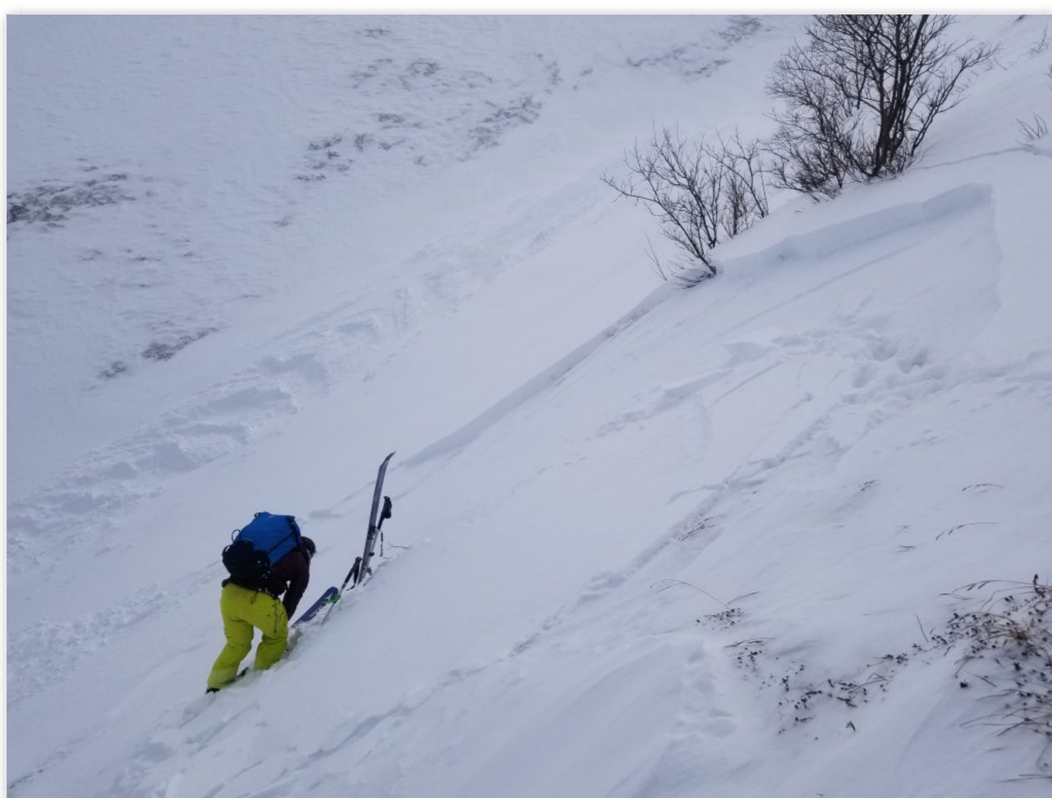
view from crown