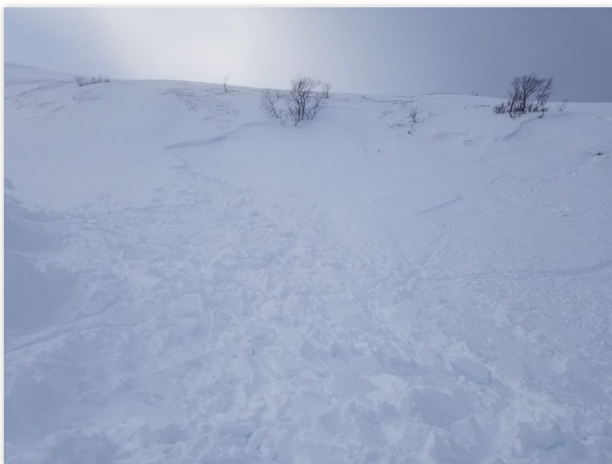
crown and runout from below